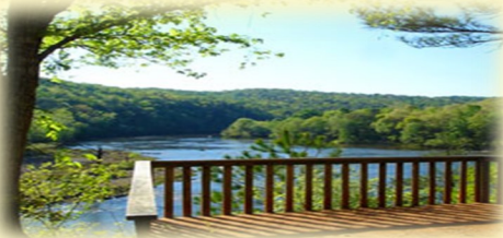
Sprewell Bluff State Park, Thomaston, GA